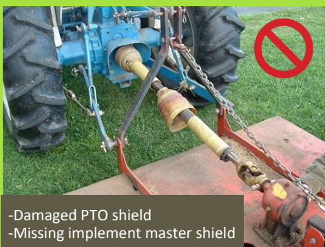
-Damaged PTO shield -Missing implement master shield

Contact us today at 877-767-7748 or email info@ropsr4u.org