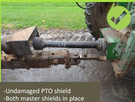
-Undamaged PTO shield -Both master shields in place